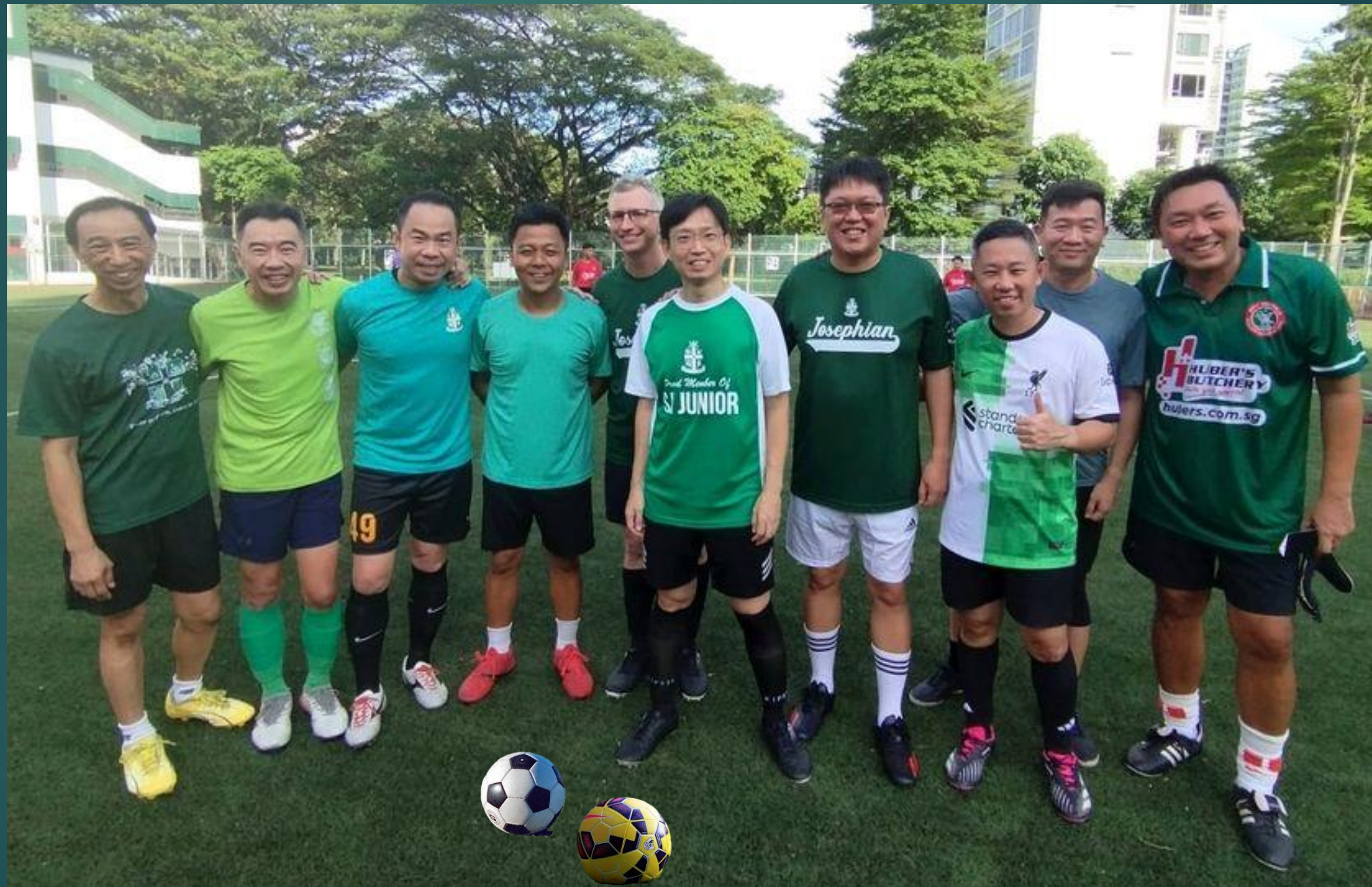
JUNIOR JOSEPHIAN FOOTBALL – 5-A-SIDE Organised by St Michael's Soccer Association