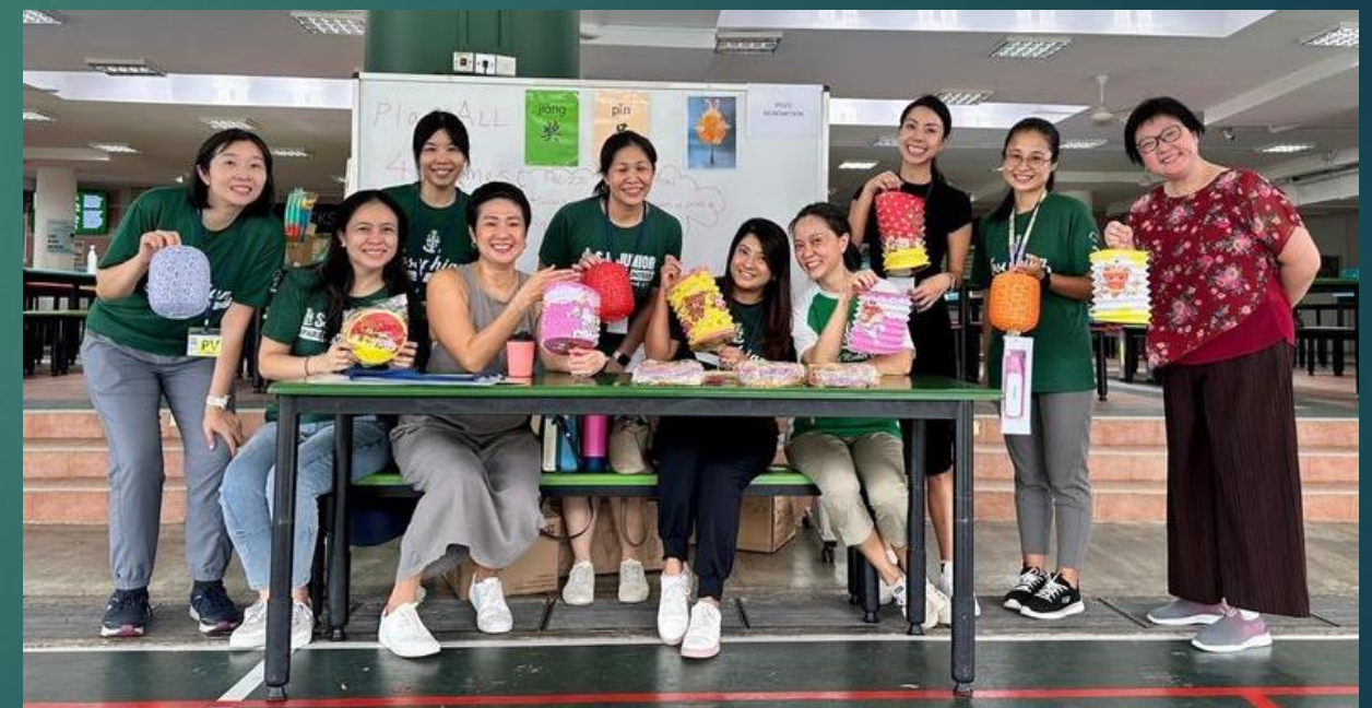
Mid-Autumn Festival Celebration