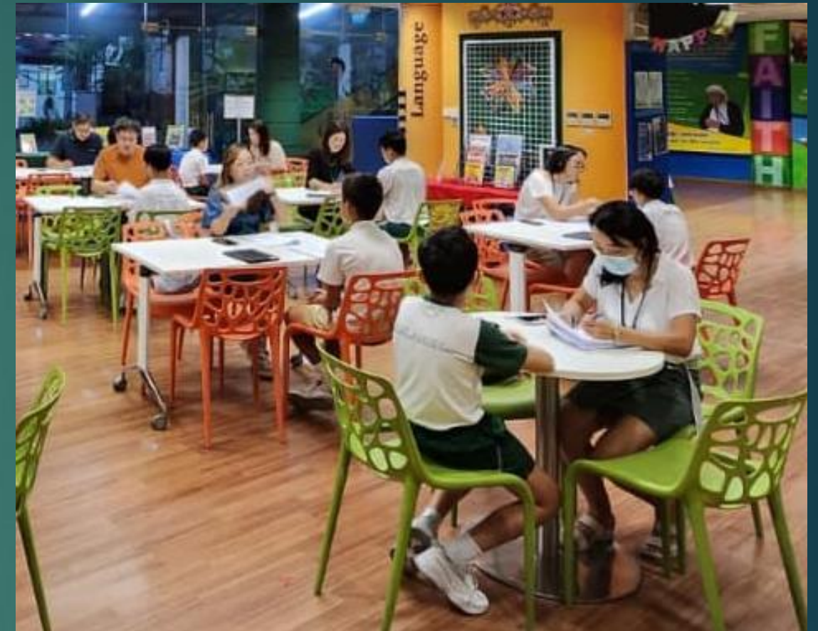
Oral Booster in-session