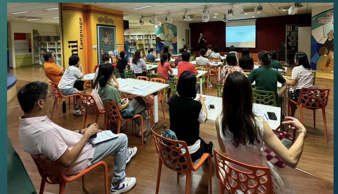
PVs in training →