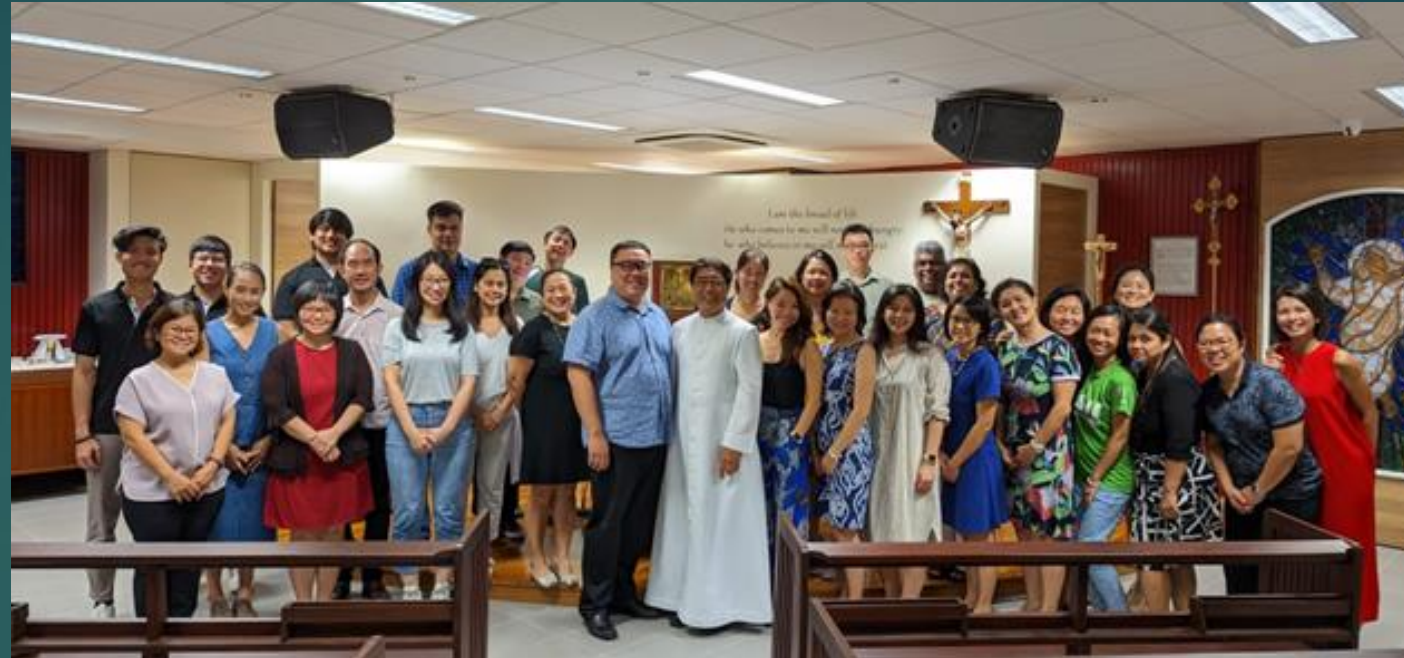
Our dedicated Catholic Parent Volunteers