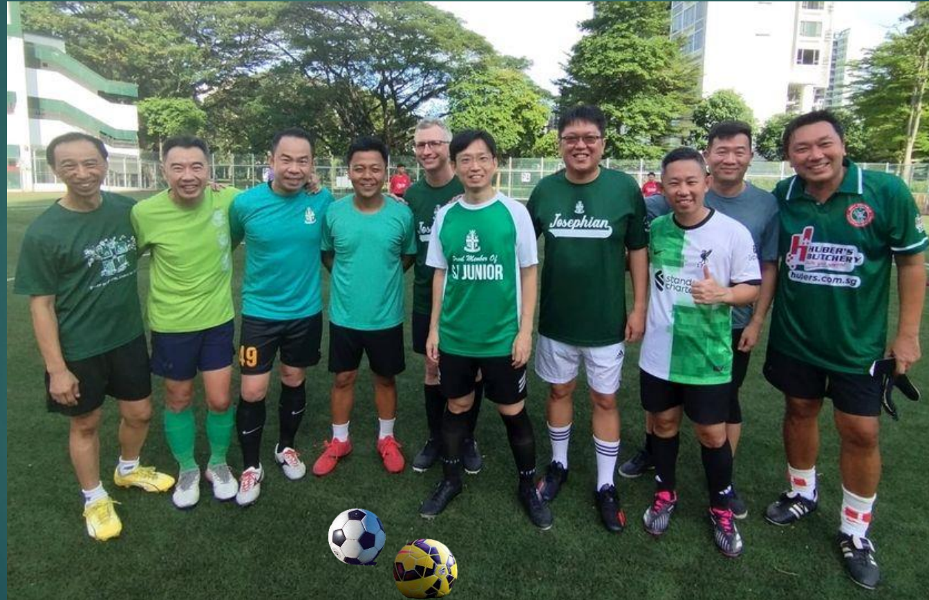
JUNIOR JOSEPHIAN FOOTBALL – 5-A-SIDE Organised by St Michael's Soccer Association