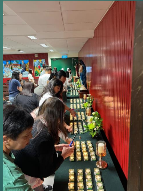
PSLE Virgil for our P6 boys