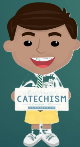
Living Well (Catechism)