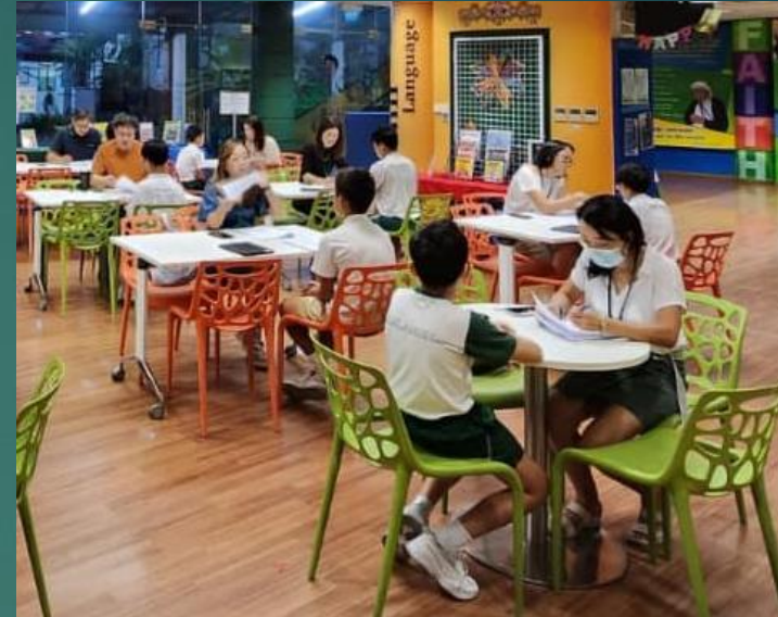
Oral Booster in-session