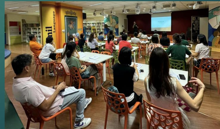
PVs in training →