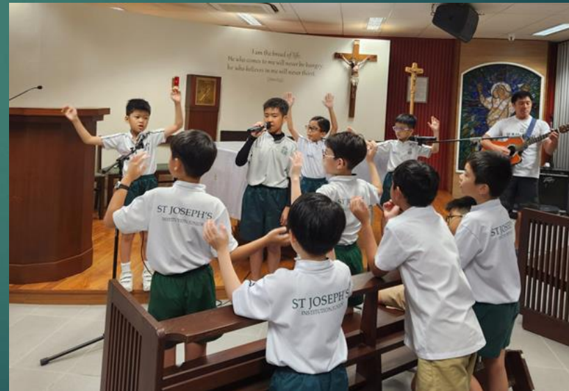
Praise and Worship by Music Ministry