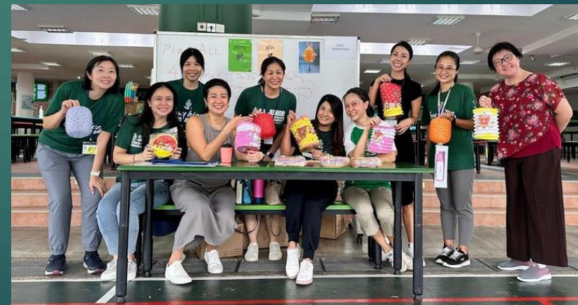
Mid-Autumn Festival Celebration